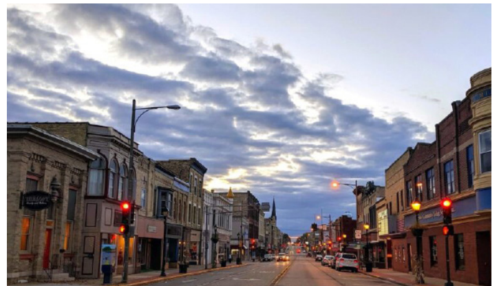
Downtown Main Street Watertown