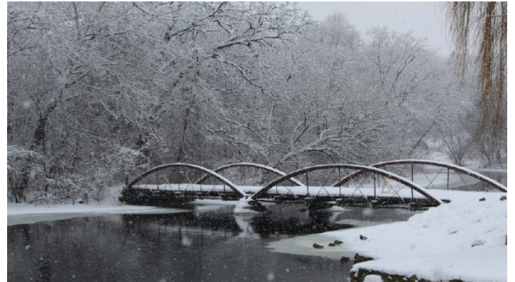
Tivoli Bridge in the winter