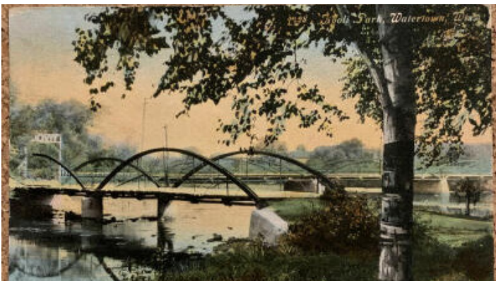
Postcard of Tivoli Bridge from 1910