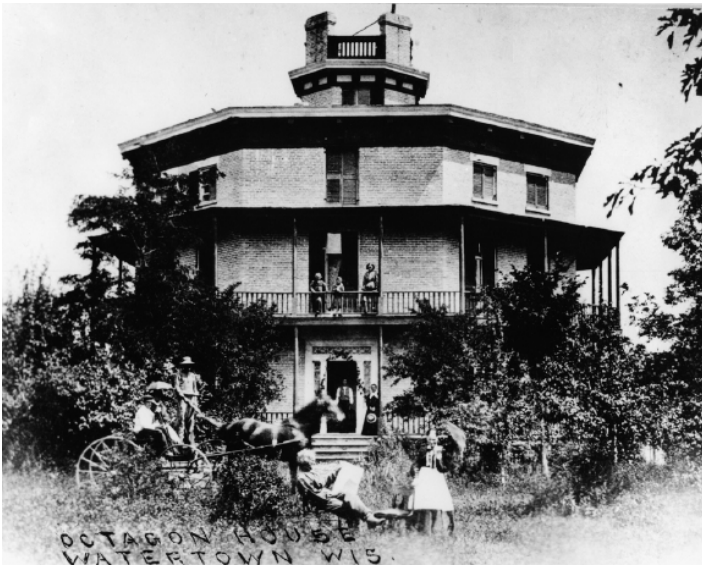
The Octagon House in 1933