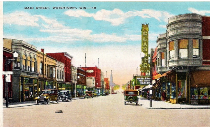
Postcard of downtown Main Street from 1927