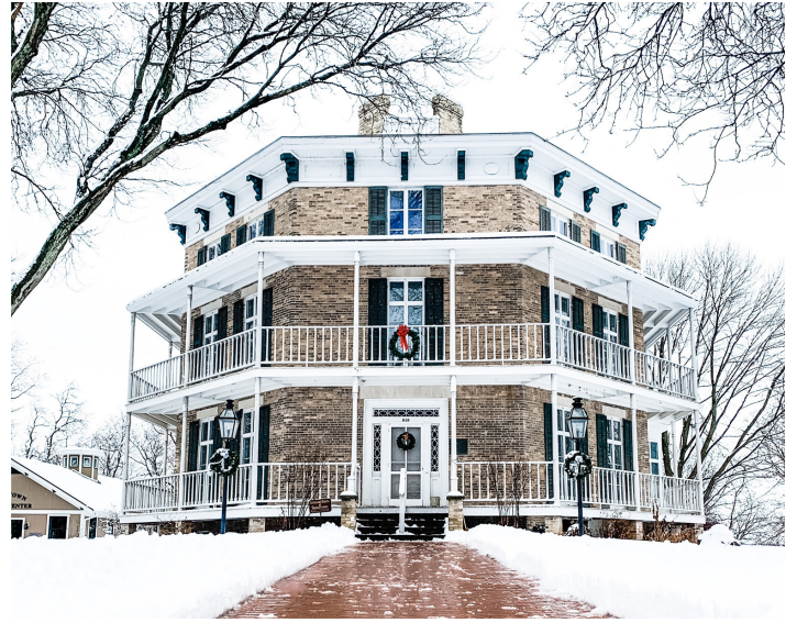
The Octagon House in the winter